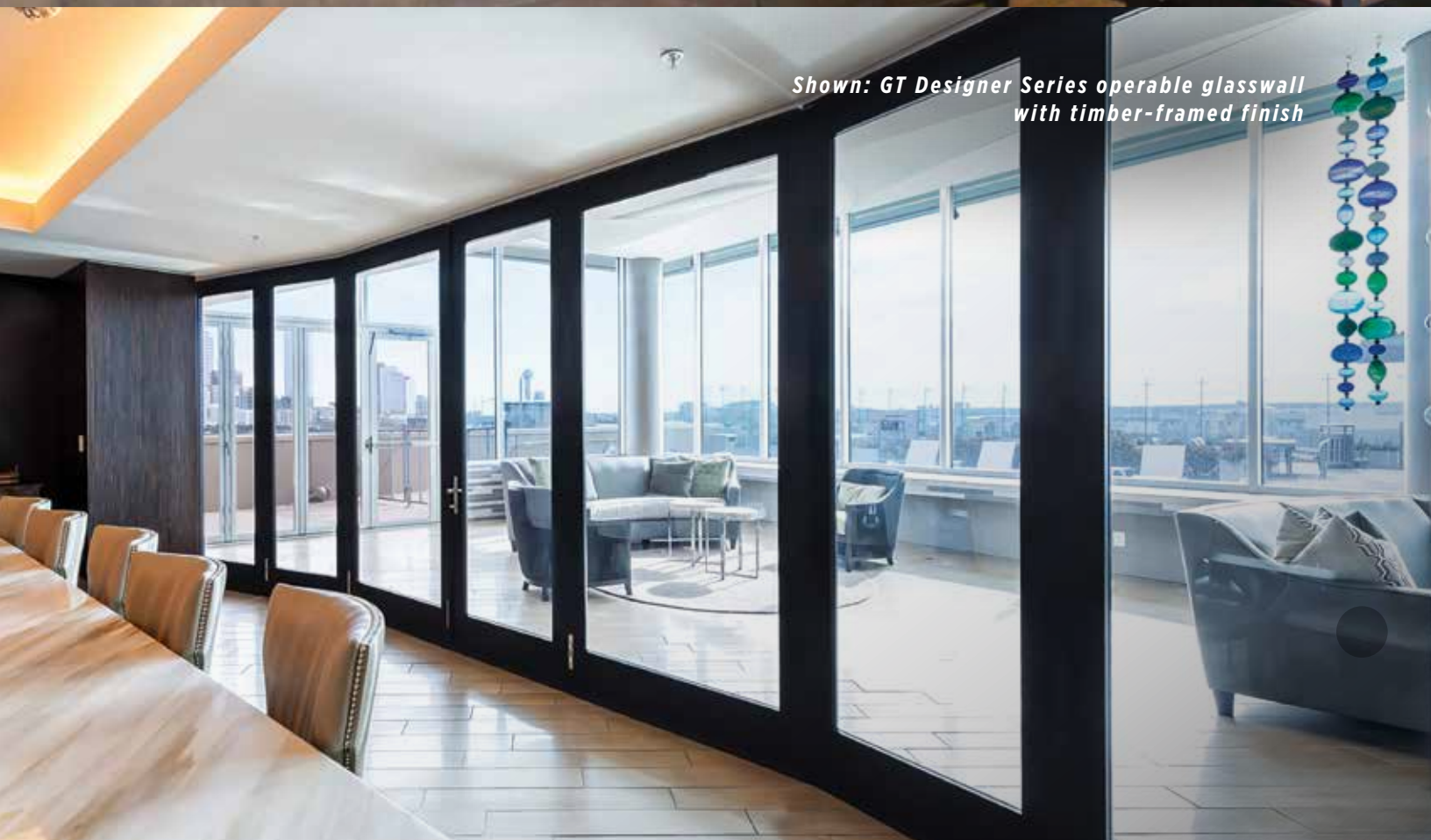
Shown: GT Designer Series operable glasswall with timber-framed finish