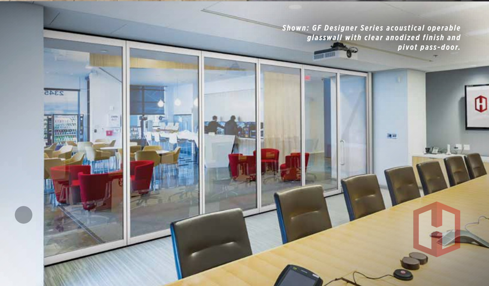
Shown: GF Designer Series acoustical operable glasswall with clear anodized finish and pivot pass-door.