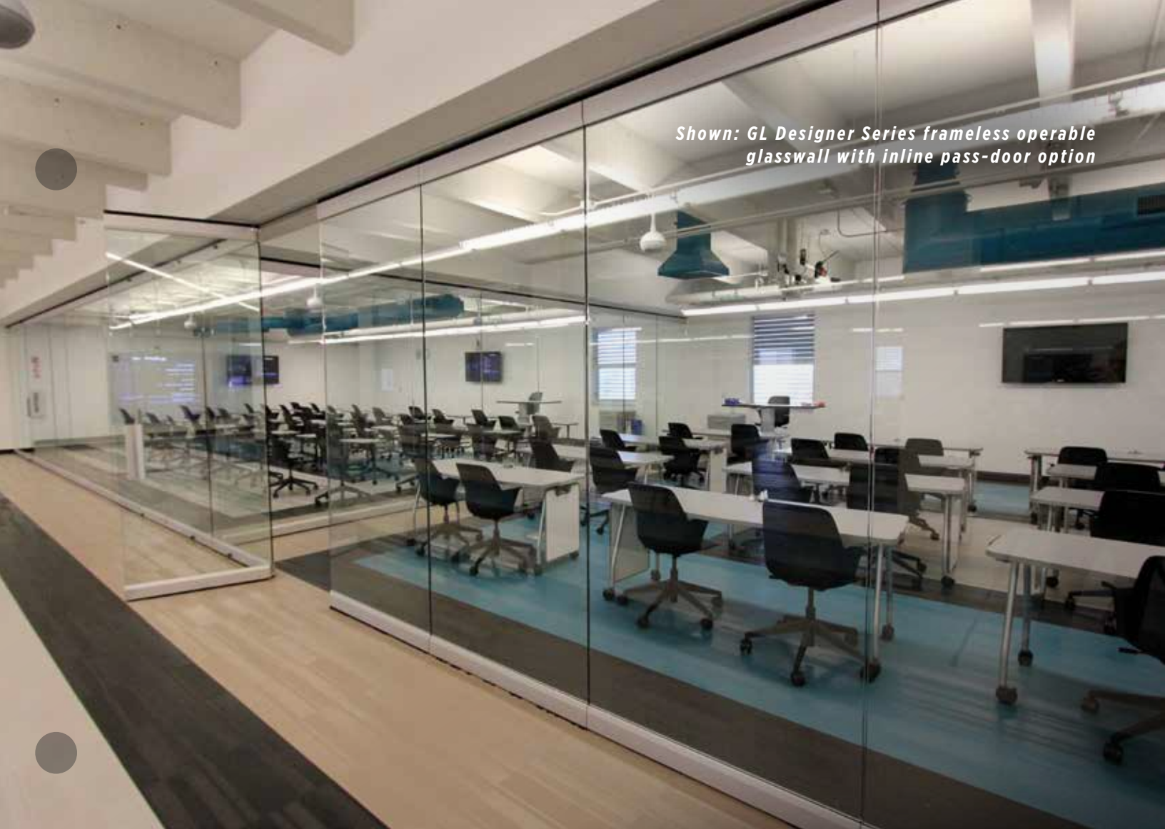
Shown: GL Designer Series frameless operable glasswall with inline pass-door option