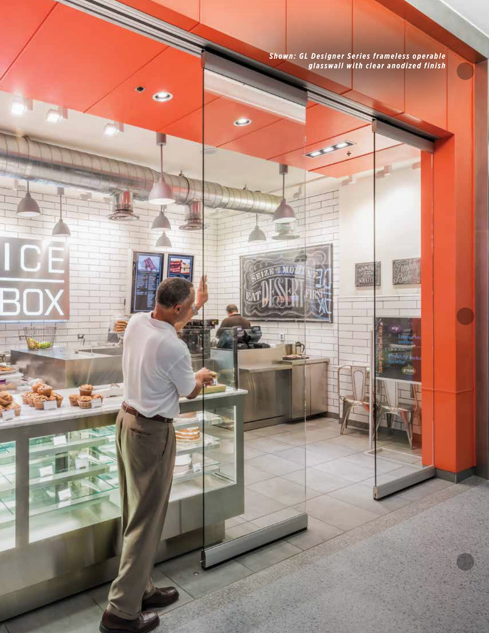
Shown: GL Designer Series frameless operable glasswall with clear anodized finish