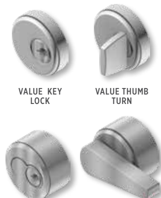
VALUE KEY LOCK