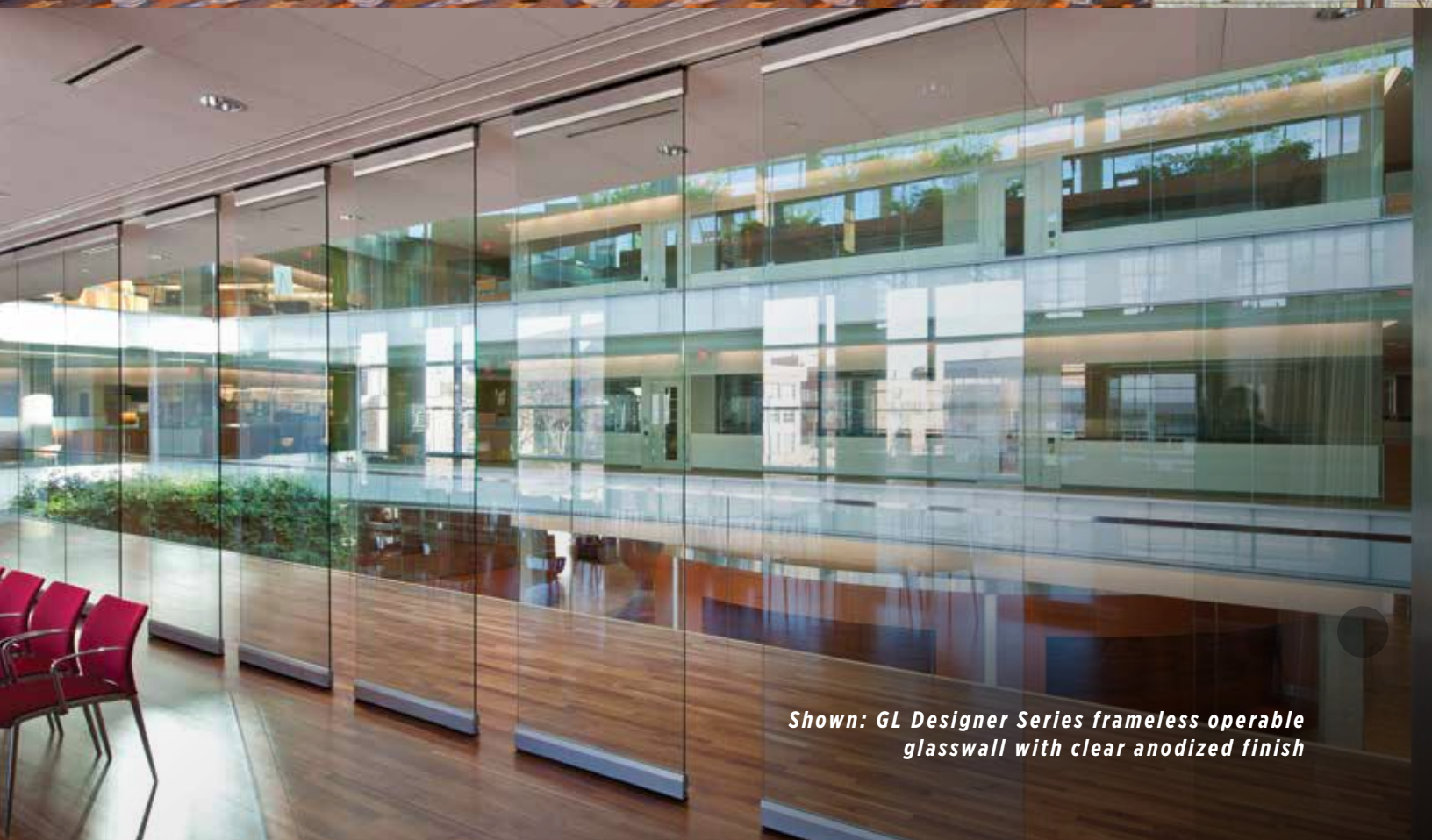
Shown: GL Designer Series frameless operable glasswall with clear anodized finish