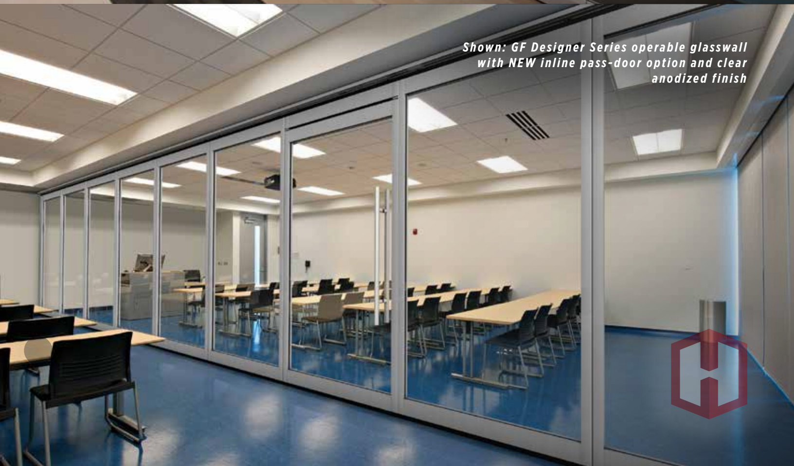
Shown: GF Designer Series operable glasswall with NEW inline pass-door option and clear anodized finish