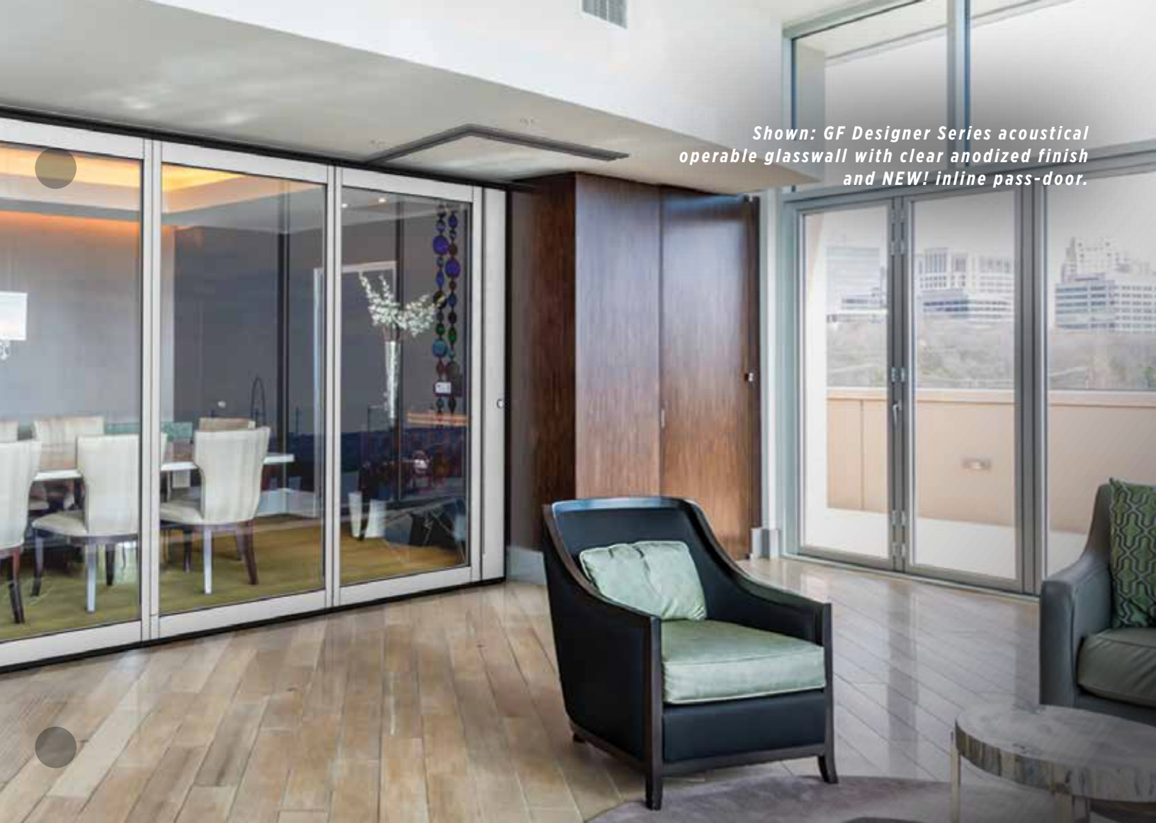
Shown: GF Designer Series acoustical operable glasswall with clear anodized finish and NEW! inline pass-door.